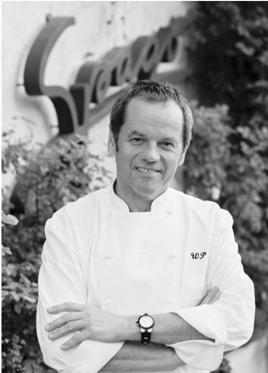
Wolfgang Puck, owner of the famous Spago restaurants and one of the most influential chef-restaurateurs in America, is credited with reviving California's rich culinary heritage. His cooking innovations, a result of blending fresh California

ingredients with his classical French techniques, are enjoyed by world leaders, stars and fellow chefs alike. He established other trend-setting restaurants like Postrio in San Francisco, Chinois on Main in Santa Monica, Granita, Vert and Trattoria del Lupo. Home chefs can also share Mr. Puck's talents through his cookbooks and, of course, through his appliances!