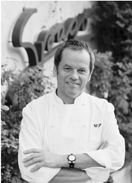
Wolfgang Puck, owner of the famous Spago restaurants and one of the most influential chef-restauranteurs in America, is credited with reviving California's rich culinary heritage. His cooking innovations, a result of blending fresh

California ingredients with his classical French techniques, are enjoyed by world leaders, stars and fellow chefs alike. He established other trend-setting restaurants like Postrio in San Francisco, Chinois on Main in Santa Monica, Vert and Trattoria del Lupo, and his latest creation, Cut, a gourmet steakhouse in the Beverly Wilshire Hotel. Home chefs can also share Mr. Puck's talents through his cookbooks and, of course, through his appliances!